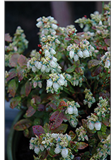
Jelly Bean Blueberry flowers

Jelly Bean Blueberry is a good choice for the edible garden, but it is also well-suited for use in outdoor pots and containers. It can be used either as 'filler' or as a 'thriller' in the 'spiller-thriller-filler' container combination, depending on the height and form of the other plants used in the container planting. Note that when grown in a container, it may not perform exactly as indicated on the tag - this is to be expected. Also note that when growing plants in outdoor containers and baskets, they may require more frequent waterings than they would in the yard or garden. Be aware that in our climate, most plants cannot be expected to survive the winter if left in containers outdoors, and this plant is no exception. Contact our store for more information on how to protect it over the winter months.