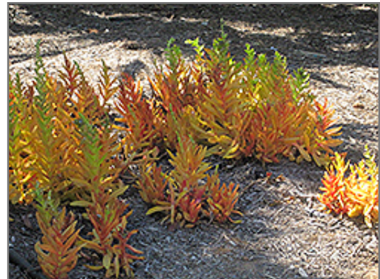
Campfire Crassula