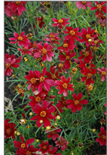
Red Satin Tickseed flowers

Red Satin Tickseed is recommended for the following landscape applications;