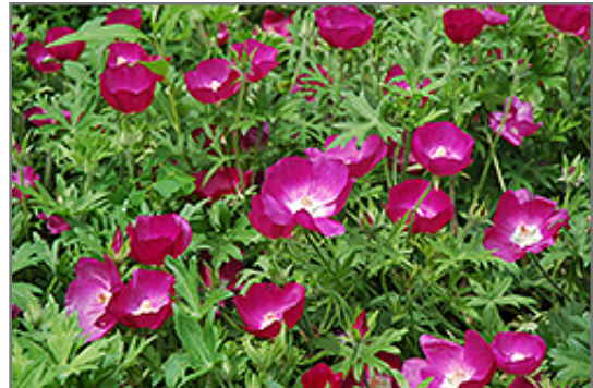
Buffalo Poppy flowers