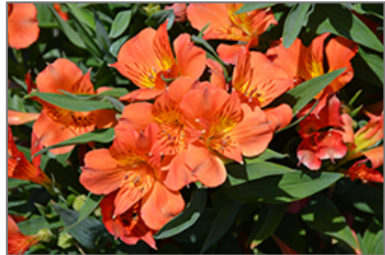
Colorita Amina Alstroemeria flowers

Colorita Amina Alstroemeria is an herbaceous annual with a mounded form. Its medium texture blends into the garden, but can always be balanced by a couple of finer or coarser plants for an effective composition.