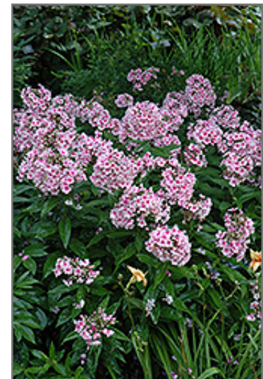
Bright Eyes Garden Phlox in bloom