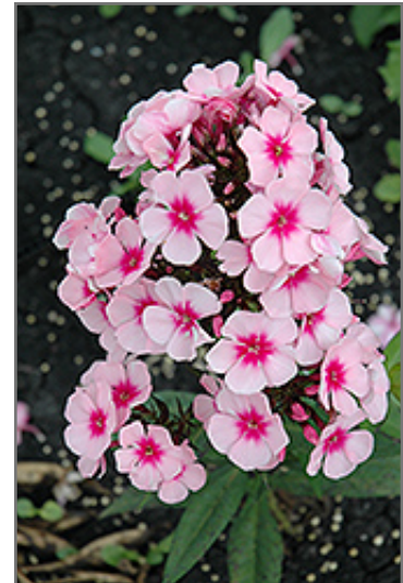
Bright Eyes Garden Phlox flowers

Bright Eyes Garden Phlox is a fine choice for the garden, but it is also a good selection for planting in outdoor pots and containers. With its upright habit of growth, it is best suited for use as a 'thriller' in the 'spiller-thriller-filler' container combination; plant it near the center of the pot, surrounded by smaller plants and those that spill over the edges. Note that when growing plants in outdoor containers and baskets, they may require more frequent waterings than they would in the yard or garden. Be aware that in our climate, most plants cannot be expected to survive the winter if left in containers outdoors, and this plant is no exception. Contact our store for more information on how to protect it over the winter months.