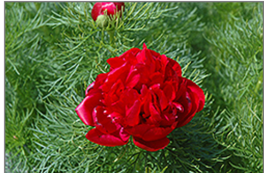
Double Fernleaf Peony flowers