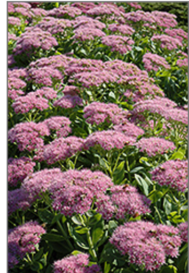
Brilliant Stonecrop flowers

Brilliant Stonecrop is recommended for the following landscape applications;