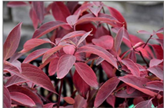
Arctic Fire Red Twig Dogwood in fall

This shrub does best in full sun to partial shade. It is an amazingly adaptable plant, tolerating both dry conditions and even some standing water. It is not particular as to soil type or pH. It is highly tolerant of urban pollution and will even thrive in inner city environments. This is a selection of a native North American species.