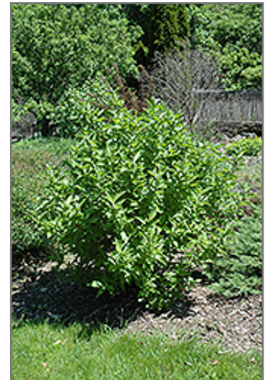
Arctic Fire Red Twig Dogwood