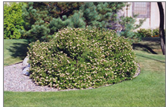
Pink Beauty Potentilla in bloom