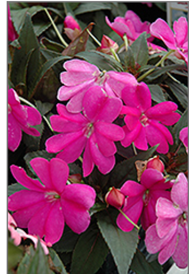
SunPatiens Compact Lilac New Guinea Impatiens flowers

SunPatiens Compact Lilac New Guinea Impatiens is recommended for the following landscape applications;