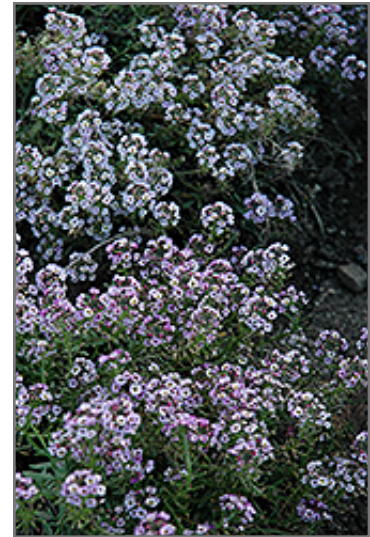
Clear Crystal Lavender Shades Sweet Alyssum flowers

Clear Crystal Lavender Shades Sweet Alyssum is a dense herbaceous annual with a trailing habit of growth, eventually spilling over the edges of hanging baskets and containers. It brings an extremely fine and delicate texture to the garden composition and should be used to full effect.