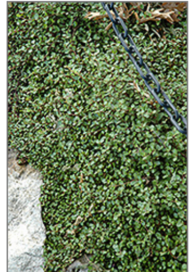
Creeping Wire Vine