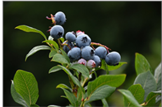
Northland Blueberry fruit