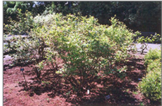
Northland Blueberry

This shrub does best in full sun to partial shade. It does best in average to evenly moist conditions, but will not tolerate standing water. It is very fussy about its soil conditions and must have sandy, acidic soils to ensure success, and is subject to chlorosis (yellowing) of the leaves in alkaline soils. It is quite intolerant of urban pollution, therefore inner city or urban streetside plantings are best avoided, and will benefit from being planted in a relatively sheltered location. Consider applying a thick mulch around the root zone in winter to protect it in exposed locations or colder microclimates. This is a selection of a native North American species.