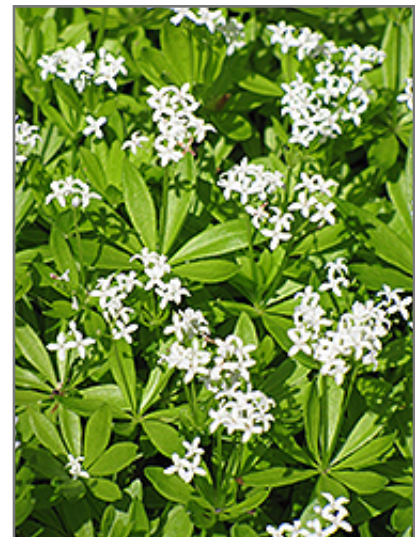
Sweet Woodruff flowers