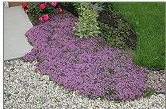
Red Creeping Thyme in bloom