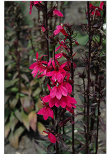
Starship Deep Rose Lobelia flowers

This is a relatively low maintenance plant, and is best cleaned up in early spring before it resumes active growth for the season. It is a good choice for attracting butterflies and hummingbirds to your yard. It has no significant negative characteristics.