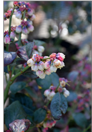
Pink Icing Blueberry flowers

Pink Icing Blueberry will grow to be about 4 feet tall at maturity, with a spread of 4 feet. It has a low canopy. It grows at a fast rate, and under ideal conditions can be expected to live for approximately 20 years. This variety requires a different selection of the same species growing nearby in order to set fruit.