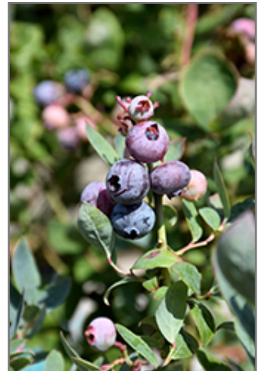
Pink Icing Blueberry fruit