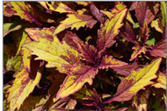
FlameThrower Spiced Curry Coleus foliage

FlameThrower Spiced Curry Coleus is recommended for the following landscape applications;