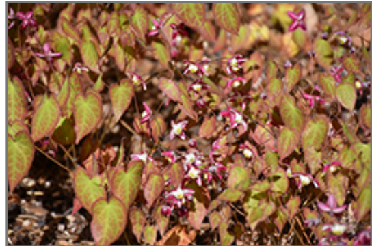
Bishop's Hat in bloom

Bishop's Hat will grow to be about 12 inches tall at maturity, with a spread of 18 inches. When grown in masses or used as a bedding plant, individual plants should be spaced approximately 15 inches apart. Its foliage tends to remain dense right to the ground, not requiring facer plants in front. It grows at a medium rate, and under ideal conditions can be expected to live for approximately 10 years.