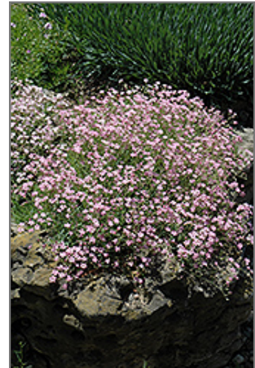
Pink Creeping Baby's Breath in bloom

Pink Creeping Baby's Breath will grow to be only 6 inches tall at maturity, with a spread of 18 inches. Its foliage tends to remain low and dense right to the ground. It grows at a fast rate, and under ideal conditions can be expected to live for approximately 10 years.