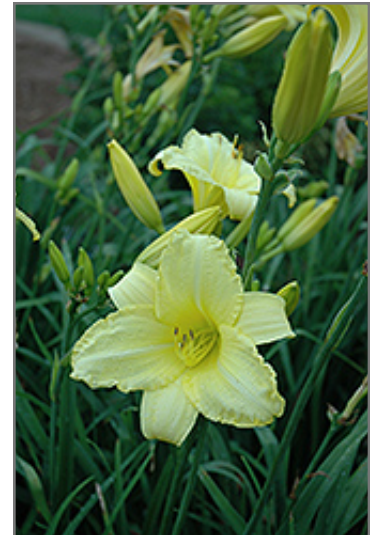
Happy Ever Appster Happy Returns Daylily flowers

Happy Ever Appster Happy Returns Daylily is recommended for the following landscape applications;