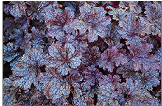
Plum Pudding Coral Bells foliage

Plum Pudding Coral Bells is recommended for the following landscape applications;