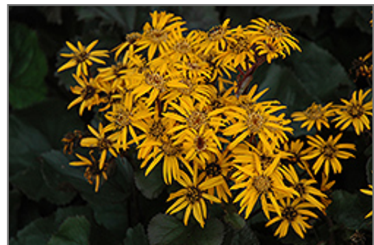
Britt Marie Crawford Rayflower flowers