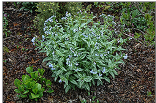
Roy Davidson Lungwort in bloom