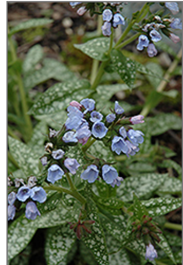
Roy Davidson Lungwort flowers

Roy Davidson Lungwort is recommended for the following landscape applications;