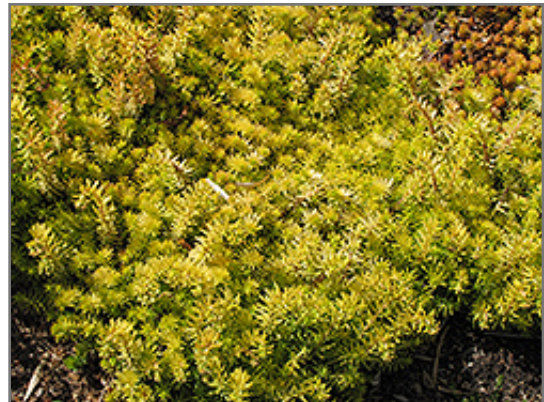
Angelina Stonecrop