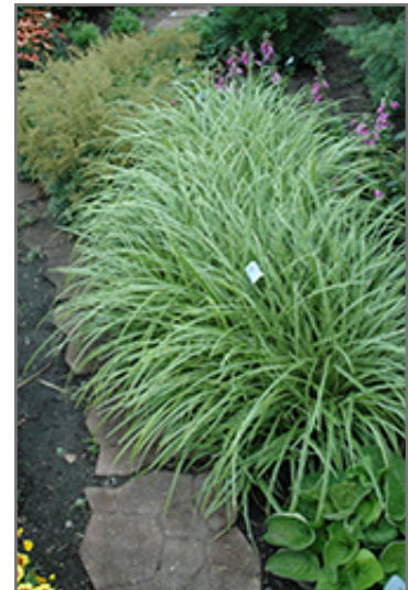
Ice Dance Sedge