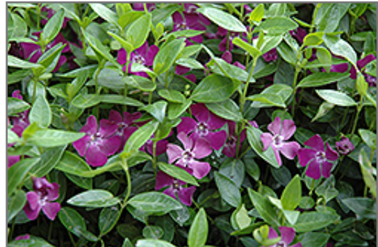
Burgundy Periwinkle flowers

Burgundy Periwinkle is an herbaceous evergreen perennial with a ground-hugging habit of growth. Its medium texture blends into the garden, but can always be balanced by a couple of finer or coarser plants for an effective composition.