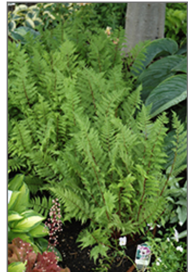
Lady in Red Fern