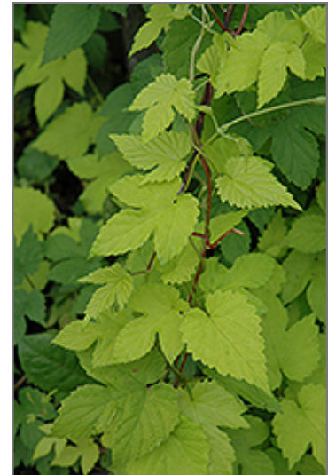
Golden Hops foliage