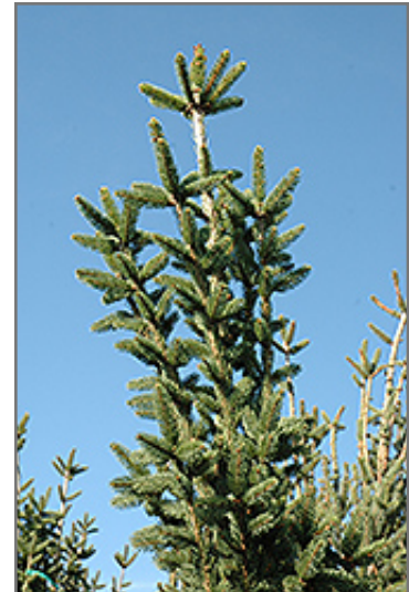
Columnar Norway Spruce foliage