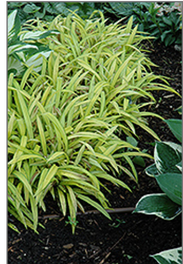
Banana Boat Broadleaf Sedge