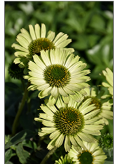
Green Jewel Coneflower flowers

This is a relatively low maintenance plant, and is best cleaned up in early spring before it resumes active growth for the season. It is a good choice for attracting butterflies to your yard, but is not particularly attractive to deer who tend to leave it alone in favor of tastier treats. It has no significant negative characteristics.