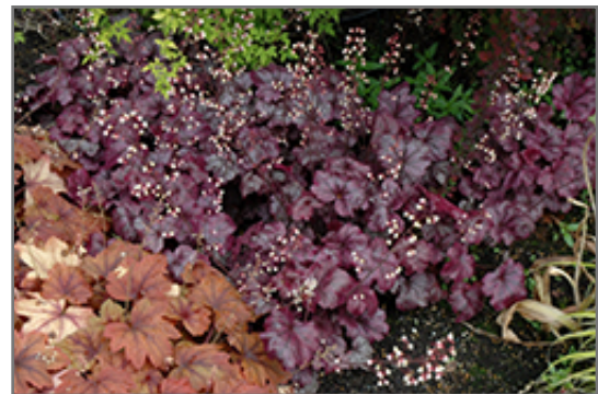
Plum Royale Coral Bells in bloom