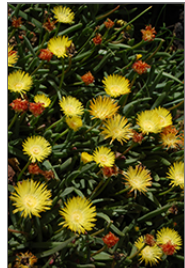
Yellow Ice Plant flowers